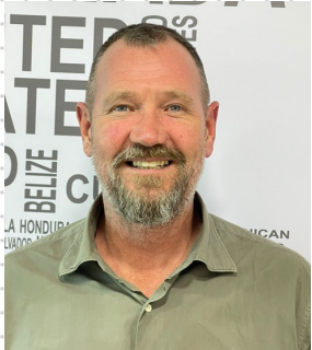
DEOHUMAN General Manager

We provide a wide range of turnkey solutions to meet your project needs. We will ensure that you receive a solution that is tailor made for your project and will endeavor to save you money and time after we have been engaged.